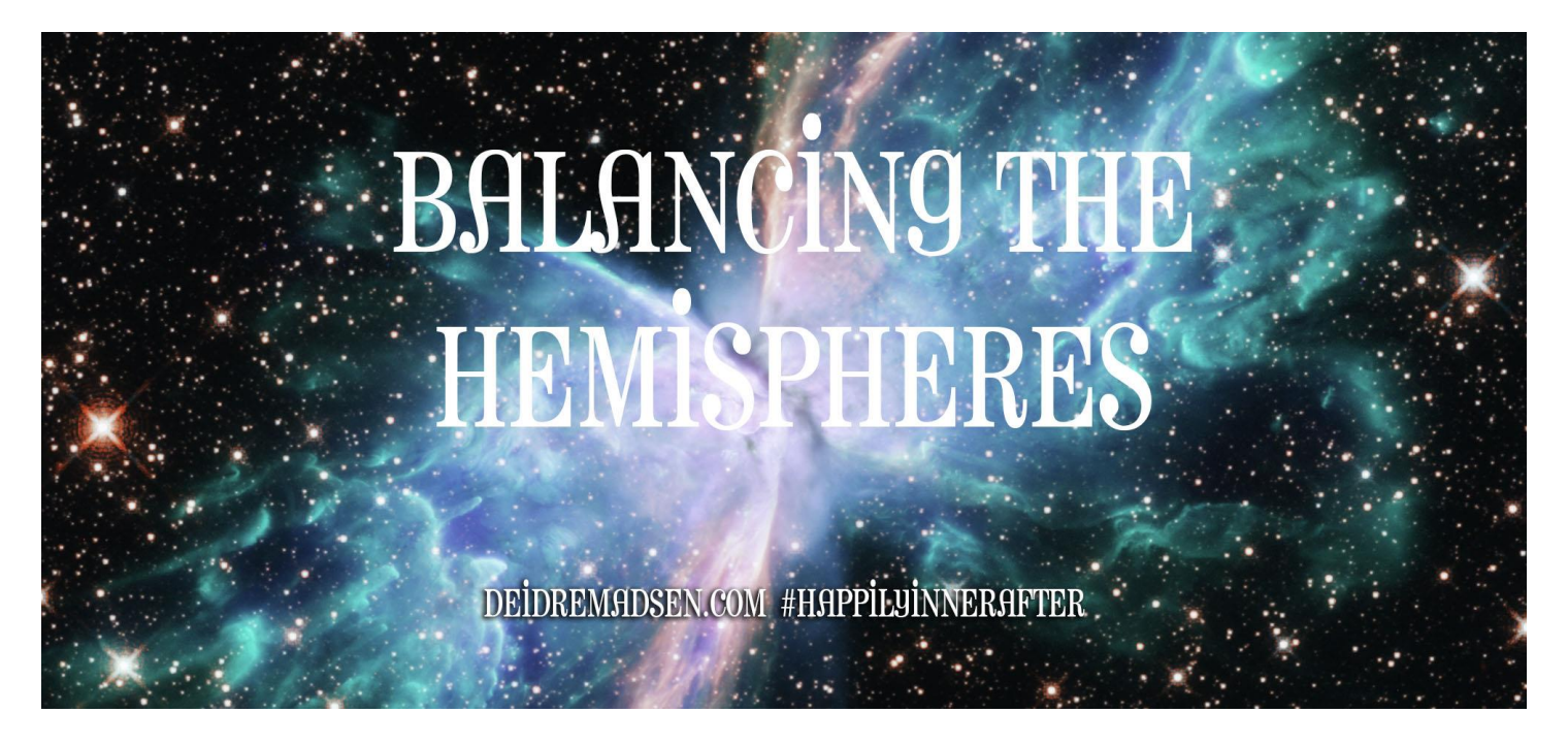
NGC 6302: The "Butterfly Nebula"